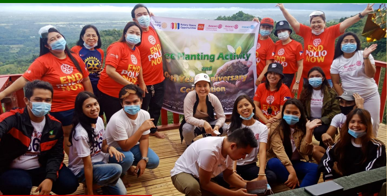
The Rotary Club of Midtown Butuan Members together with Rotaractors during the Celebration of 10 th Year Charter anniversary and Tree Planting Activity at Buenavista., Agusan del Norte.